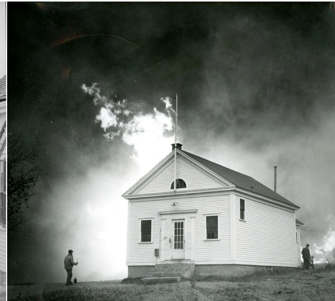
historical images courtesy of NEPM.org