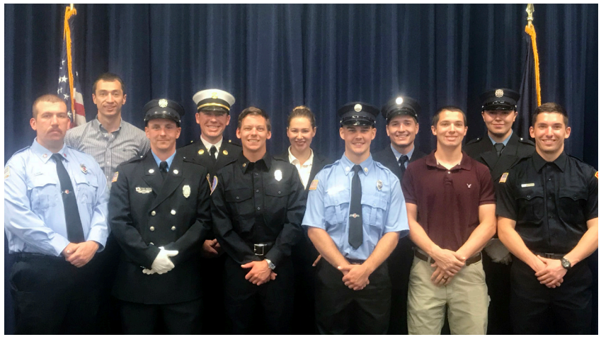
Graduates of the 2017 Fire Fighter Academy

Tuition: $2000 ($2500 for out-of-state applicants, subject to availability) which includes course textbooks and materials; transportation to training facilities; meals; and lodging. A check, purchase order, or money order must be included with your registration.