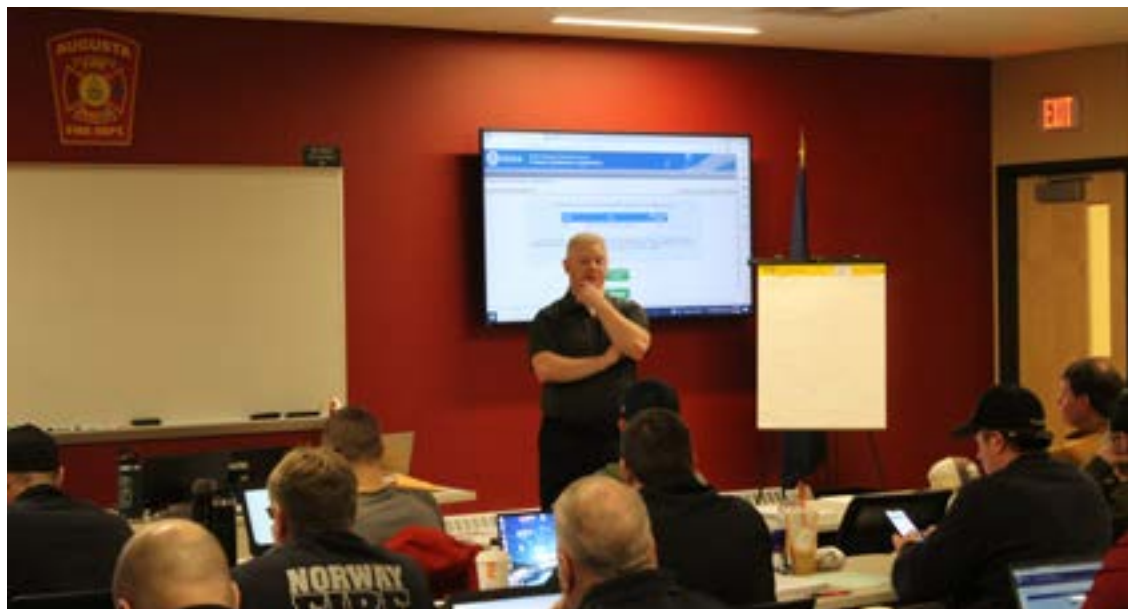
National Fire Academy Preparation for Initial Company Operations Spring 2023