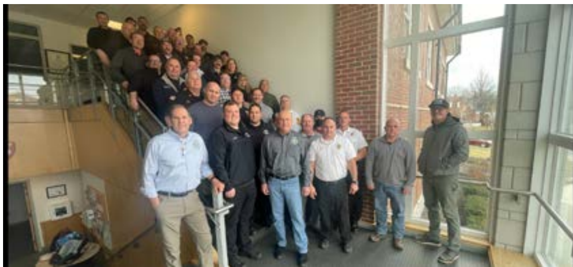
Fire Department Safety Officer (Pro-Board Program) Westbrook