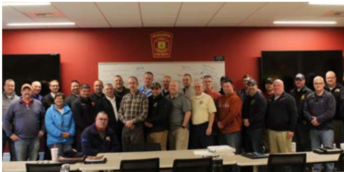
Fire Department Safety Officer (Pro-Board Program) Augusta