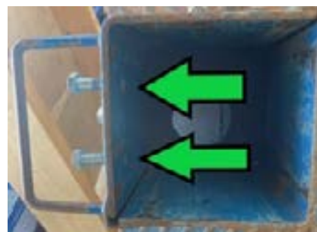
Proper Storage of Base

This is the condition we aim to see our trailers in upon return.