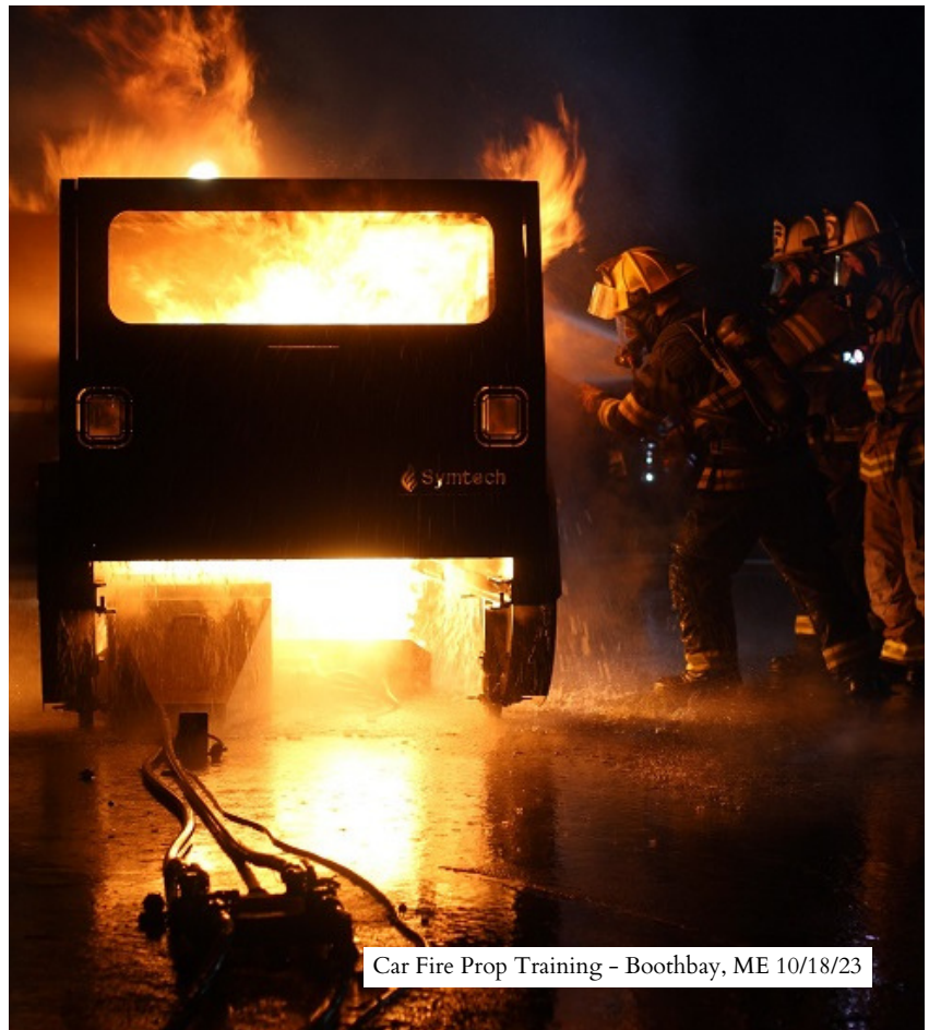
Car Fire Prop Training – Boothbay, ME 10/18/23

We are currently working on dates for the Red Maze and the new car fire prop for next spring. If you are a municipal fire instructor, state fire instructor, training officer, please check back for these fliers. Sign up and get qualified on these valuable training props!