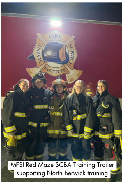
MFSI Red Maze SCBA Training Trailer supporting North Berwick training