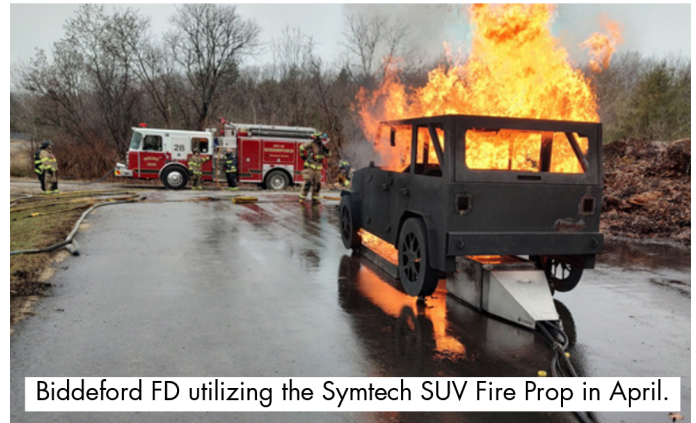
Biddeford FD utilizing the Symtech SUV Fire Prop in April.

Collaborations with outside organizations like RAFT and FDSOA are planned months out, so they are not included in the lists to the left.