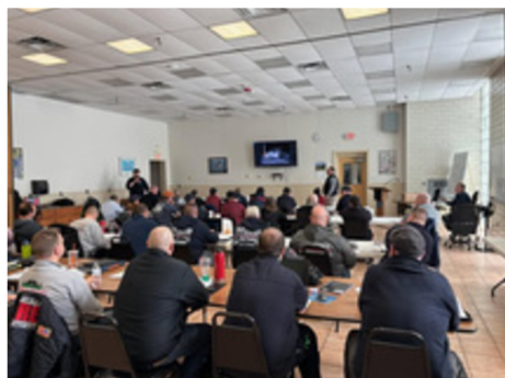
Fire Investigator led by Maine State Fire Marshal's Office had almost 40 candidates.