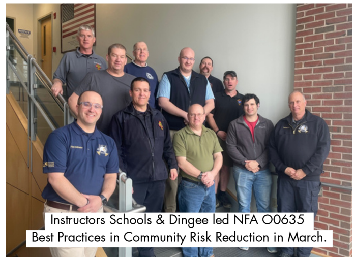
Instructors Schools & Dingee led NFA O0635 Best Practices in Community Risk Reduction in March.