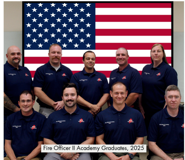
Fire Officer II Academy Graduates, 2025