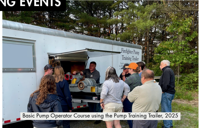
Basic Pump Operator Course using the Pump Training Trailer, 2025

The next program is being planned for Summer 2026. More information TBA.