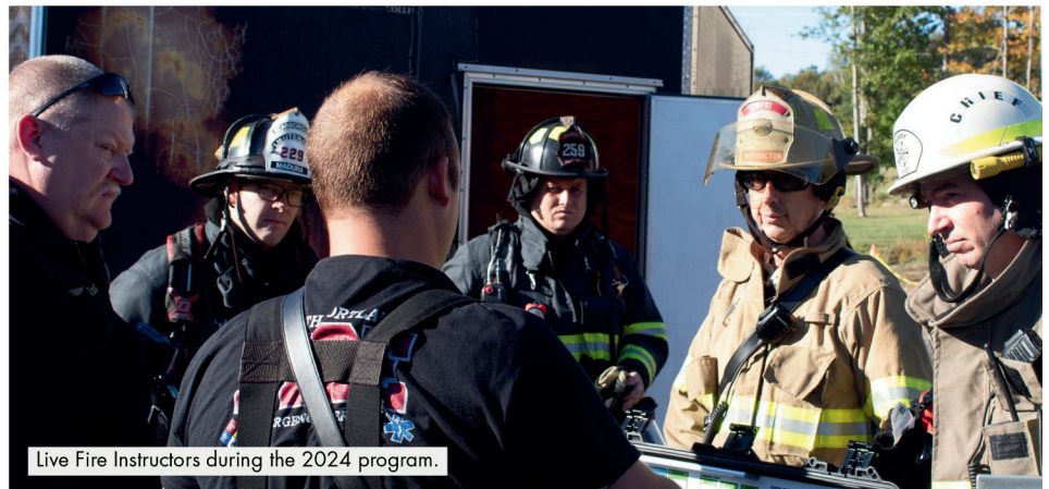
Live Fire Instructors during the 2024 program.