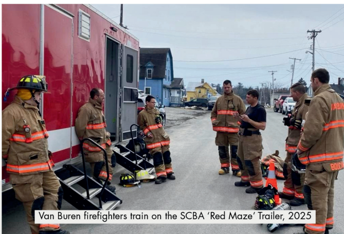
Van Buren firefighters train on the SCBA 'Red Maze' Trailer, 2025